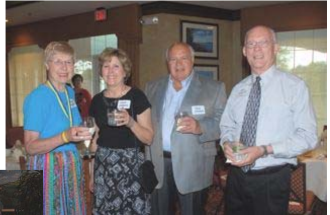
A Few Old Friends at the Changing of the Guard