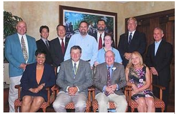
The New Board