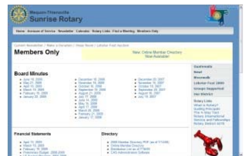
Members' Only page on the website

The website is the public face of our Club, visited by several hundred unique visitors each month. Let me know if you have suggestions for improvement or an article that should be included. I'd love to hear from you!