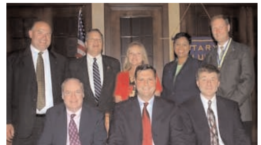
2008 - 2009 Board of Directors