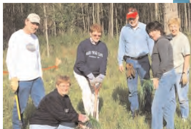
Work day at Pukait Woods, Rotary Park